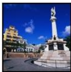
San Juan, Puerto Rico (Day 4)

Take a break and relax on your own semi-private island. Located just a short boat ride away from Nassau, Blackbeard's Cay is surrounded by crystal-clear turquoise water, sandy beaches and swaying palm trees. Or better yet, check out the Stingray Adventure. This amazing experience could easily be the highlight of your trip. Relive the swashbuckling past on an exciting pirates and dungeons tour of Fort Charlotte and the Pirates of Nassau Museum. (Eye patches and peg legs not included.) Go on a glass-bottom-boat tour for a glimpse into the underwater world of the Bahamas. Snorkel with the stingrays at Blue Lagoon Island. Visit Predator Lagoon where you'll see sharks, barracuda and many other creatures from the deep. Dance the calypso and sip a refreshing rum punch while sailing aboard the 85-foot Yellowbird. Marvel at the flora and watch the famous "marching" flamingoes at Ardastra Gardens and Conservation Center. For an exciting adventure, hop on the powerboat Thriller, Nassau's fastest ride. Enjoy Nassau Harbor, Paradise Island and many other amazing spots.