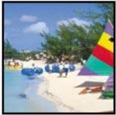
Half Moon Cay, Bahamas, The (Day 7)

Take a ride on Skyline Drive and enjoy a breathtaking view of St. Thomas Harbor. Then travel to Mountain Top, the highest point on St. Thomas, and see spectacular views of Magens Bay, one of the most beautiful beaches in the world. Check out Coral World Marine Park, where you can touch sea stars at the touch pool or explore the mystery of life in a mangrove lagoon off the Coastal Trail. Sit back and enjoy a relaxing half-day sail to Buck Island aboard a large sailing yacht, then snorkel in Turtle Cove. Submerge yourself in a sci-fi adventure. Trek around coral reefs and get up close and personal with the marine life on the Atlantis Submarine. Experience a bird's-eye view of the beauty of St. Thomas on an exciting helicopter adventure. Travel 700 feet above the sea via skyride to The Paradise Point and see the most fantastic vistas in the Caribbean.