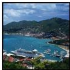
St. Thomas, U.S. Virgin Islands (Day 5)

See Baño Grande, a natural swimming pool. Then take a walk on Camitillo Trail and look for the artificial nest of the Puerto Rican parrot and the flora and fauna of the Palo Colorado forest. Explore Old San Juan, the second-oldest European settlement in the New World. Ride to San Felipe El Morro, the most dramatic of all the city's military fortifications. Visit the Casa Blanca Museum & Gardens, the Ballaja Barracks, Quincentennial Square, San Jose Church, San Juan Cathedral, and Cristo Chapel.